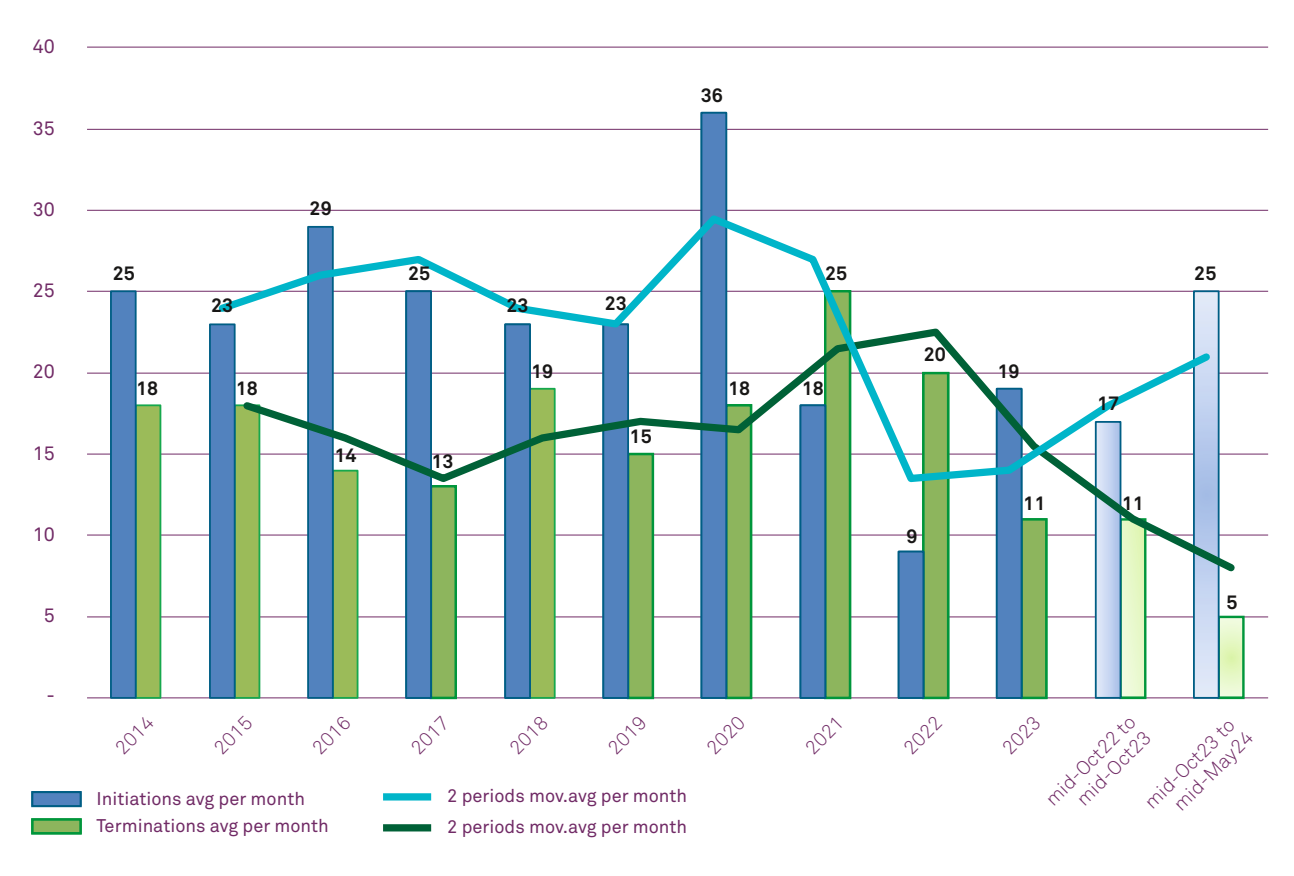
Chart 5 Average number of trade remedy initiations and terminations per month, from 2014 to mid-May 2024

Note: Values are rounded.