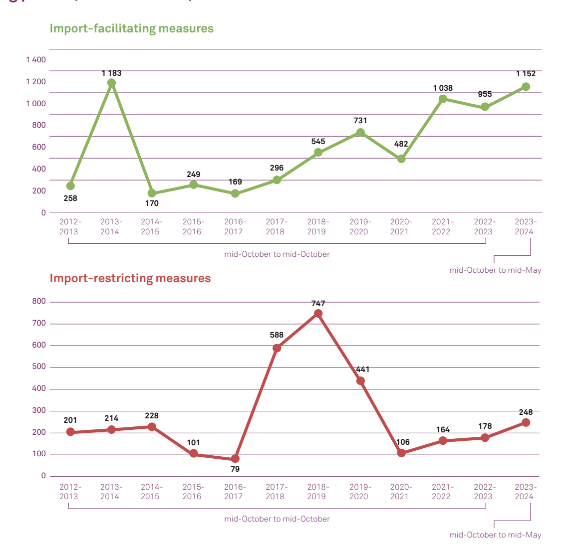
Chart 4 Trade coverage of new import-facilitating and import-restricting measures in each reporting period (not cumulative) in USD billion

Note: These figures are estimates and represent the trade coverage of the measures (i.e., annual imports of the products concerned from economies affected by the measures) introduced during each reporting period, and not the cumulative impact of the trade measures.