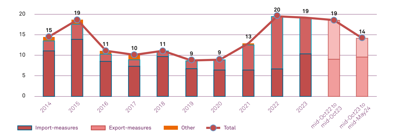
Chart 6 Average number of other trade and trade-related measures implemented per month by type, from 2014 to mid-May 2024