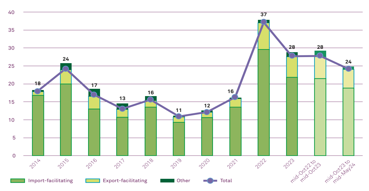
Chart 3 Average number of trade-facilitating measures on goods implemented per month by type, from 2014 to mid-May 2024

Note: Values are rounded. Revised data reflect changes undertaken in the TMDB to fine-tune and update the available information. Other refers to measures, including administrative changes, that may affect both imports and exports.